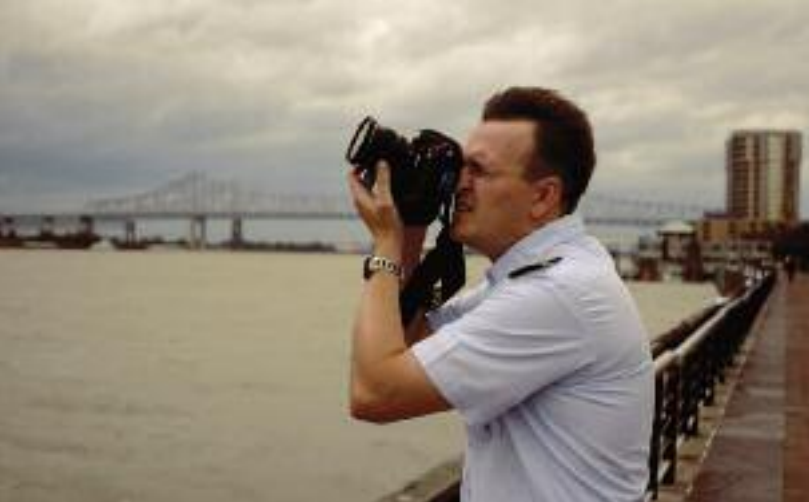
Wyman captures images of the pre-storm evacuation efforts prior to Hurricane Ike in 2004 in New Orleans.