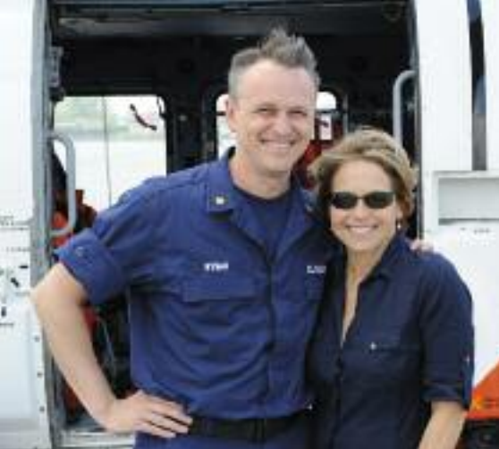
Wyman escorted Katie Couric during her visit to New Orleans to cover the Deepwater Horizon oil spill response efforts for CBS News.